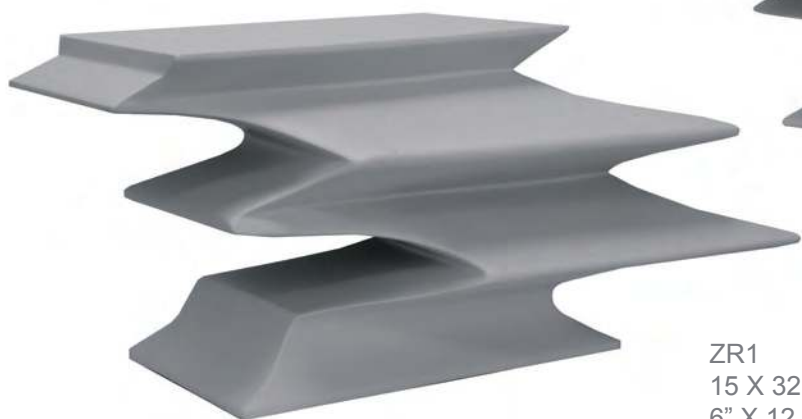
ZR1 15 X 32 18CM 6" X 12.5" X 7"